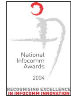
Most Innovative Product/Service National Infocomm Award 2004