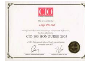
CIO 100 Honouree 2005 & 2006