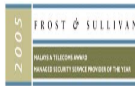
F&S MSSP Of The Year 2005